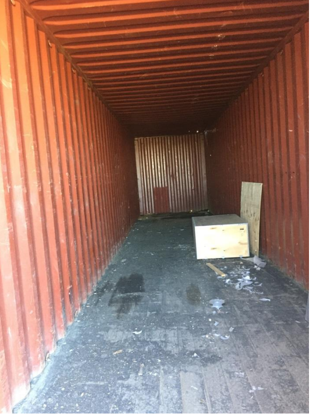
Lot #3 ITT DRF_1774