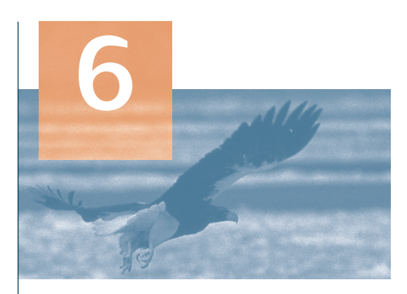
Indigenous Peoples' Consultation Programme